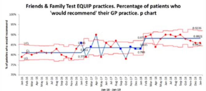
P-chart showing patient satisfaction through Friends and Family Test scores from January 2016 to January 2019 for practices participating in EQUIP.

We believe that happy teams provide better patient experience.